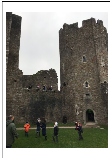
Year 1 children enjoyed their trip to Caerphilly Castle this week.