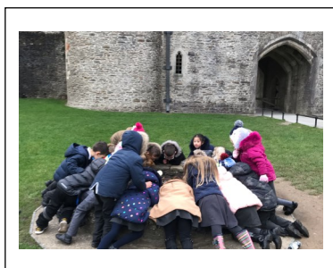
More Caerphilly fun!